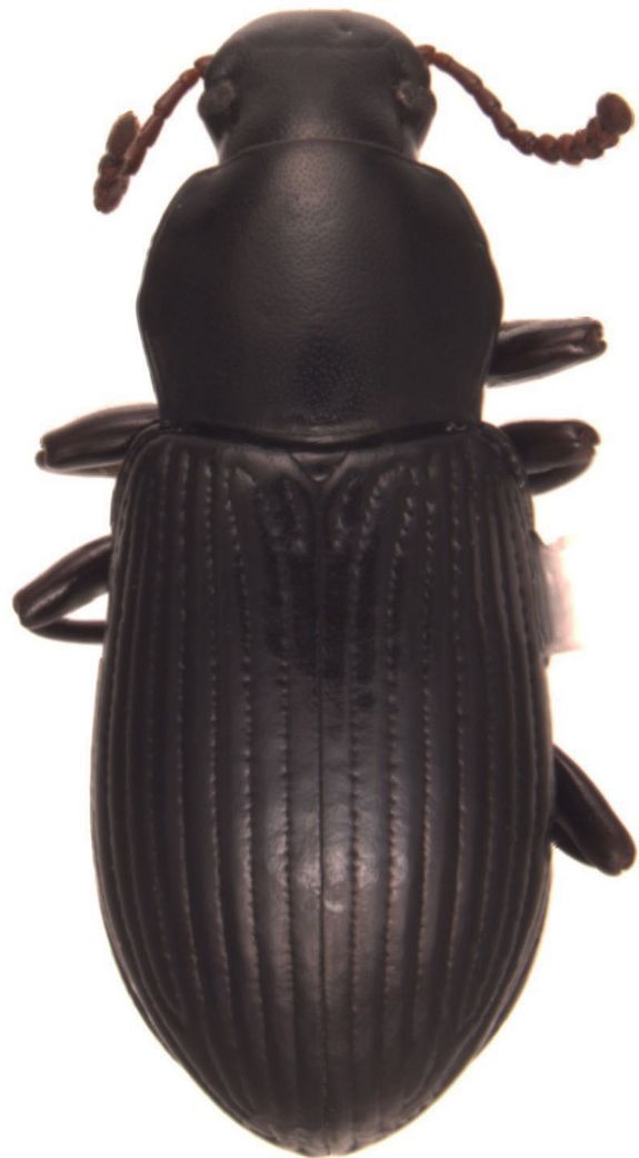
Figure 4. Hydissus vulgaris (Olliff, 1889).

Material examined. 1 / Blackburn Id, S side 31.5351°S 159.0592°E, 26 m, soil / debris under old Melaleuca bushes above cliff, 15.viii.2019, C. Reid; 1 / north slope Intermediate Hill, 31.5434°S 159.0808°E, 52 m, dead wood / leaf litter,