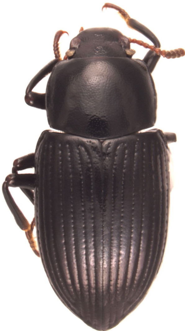
Figure 5. Metisopus curtulus (Olliff, 1889).

Material examined. 2 / Blackburn Id, S side 31.5351°S 159.0592°E, 26 m, soil / debris under old Melaleuca bushes above cliff, 15.viii.2019, C. Reid; 1 / Blackburn Id, S side 31.5350°S 159.0594°E, 32 m, soil / debris under Lagunaria , low bush, 15.viii.2019, C. Reid; 1[fragment] / Blackburn Id, S side 31.5351°S 159.0598°E, 20 m, soil / debris under