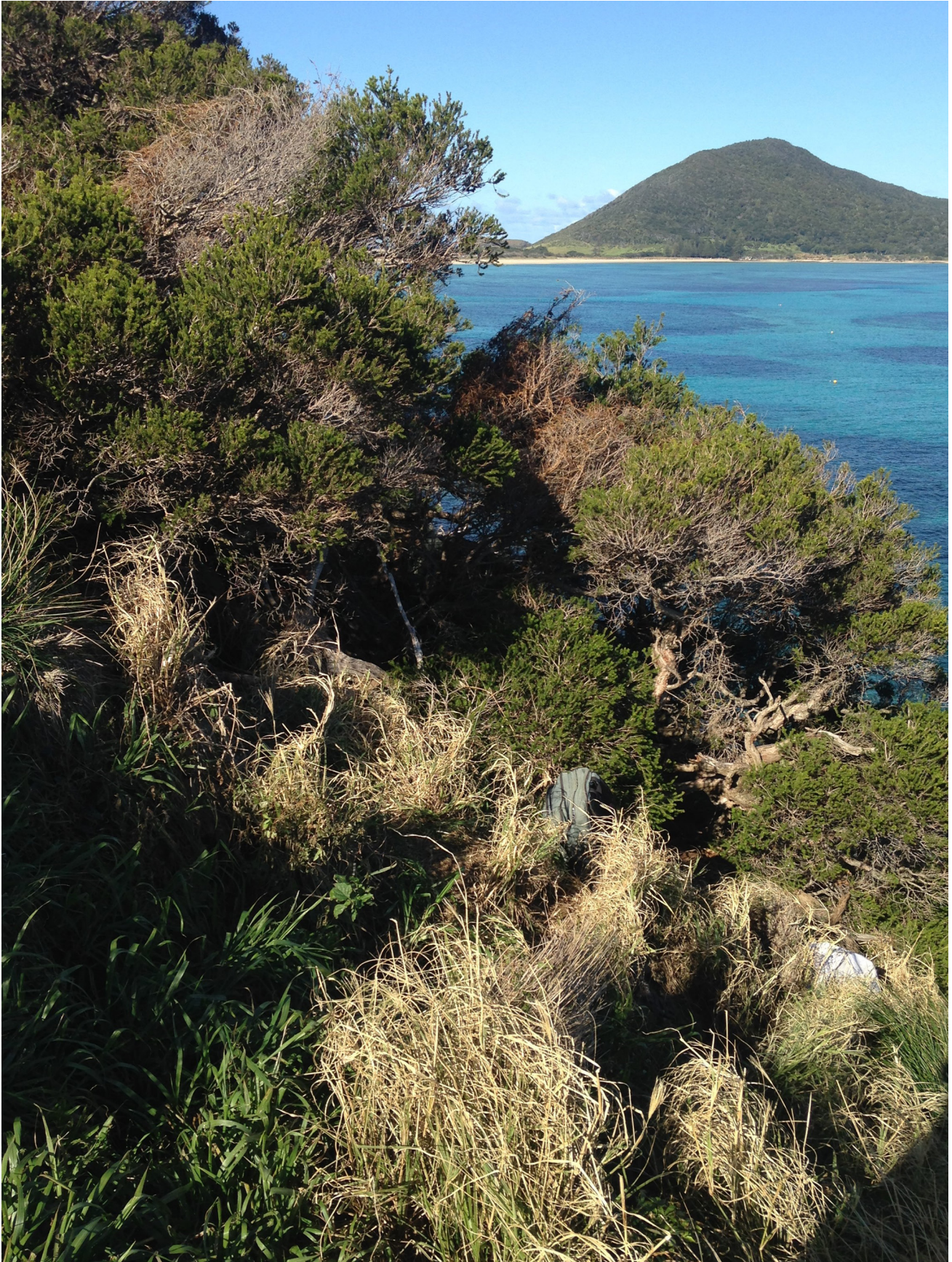
Figure 8. Vegetation including Melaleuca bushes, top of cliff on southwestern side of Blackburn Island.