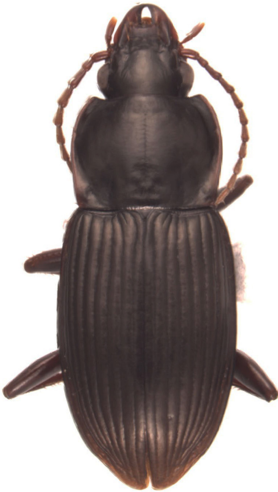
Figure 2. Prosopogmus suspectus Chaudoir, 1878.