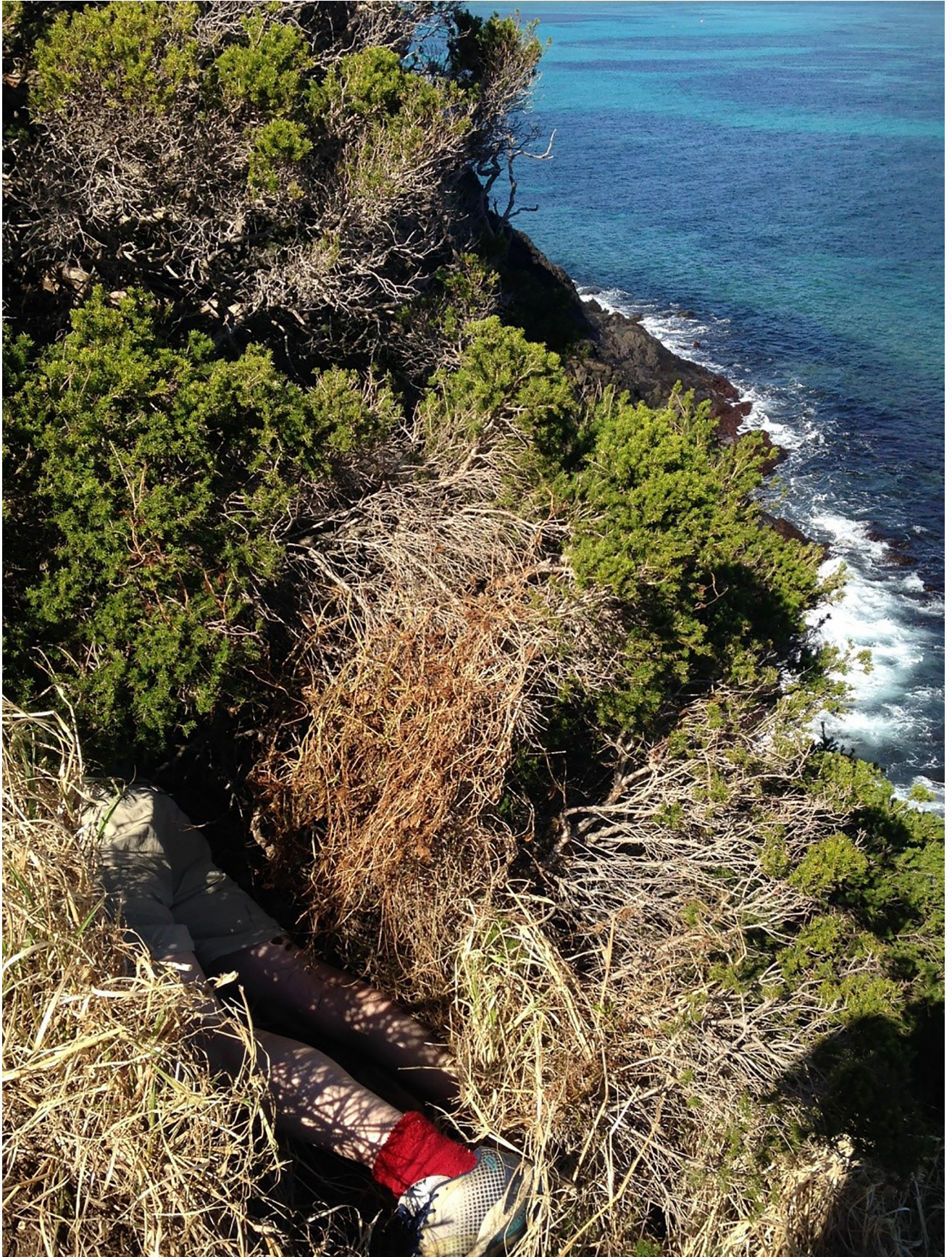
Figure 7. One of the authors (CAMR) crawling under Melaleuca bushes, top of cliff on southwestern side of Blackburn Island.