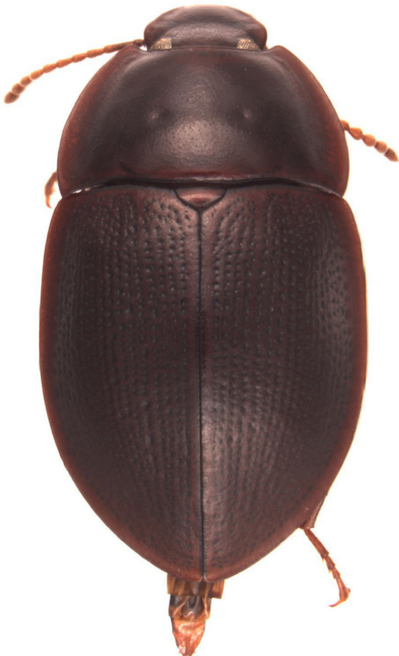
Figure 3. Celibe exulans (Pascoe, 1866).

Material examined. 1[elytron] / Blackburn Id, S side 31.5348°S 159.0585°E, 16 m, soil / debris under Melaleuca bushes above cliff, 15.viii.2019 C. Reid; 1[fragment] / Blackburn Id, S side 31.5351°S 159.0592°E, 26 m, soil / debris under old Melaleuca bushes above cliff, 15.viii.2019, C. Reid; 1[fragment] / Blackburn Id, S side 31.5350°S 159.0594°E, 32 m, soil / debris under Lagunaria , low bush, 15.viii.2019, C. Reid; 1[fragment] / Blackburn Id, S side 31.5351°S 159.0598°E, 20 m, soil / debris under Melaleuca bushes above cliff, 15.viii.2019, C. Reid; 1 / Blinky Beach, 31.5378°S 159.0806°E, 4–6 m, dead wood etc under stunted forest on dunes, 12.viii.2019, C. Reid & volunteers; 1[fragment] / Boat Harbour, vic. 31.5596°S 159.0982°E, 5–20 m, swept / rotten wood, 14.viii.2019, C. Reid & volunteers; 2 / Clear Place track, 1st 100 m from rd, 31.5276°S 159.0750°E, 42 m at night, 15.viii.2019, C. Reid, S. Thompson & volunteers; 1 / Mutton Bird Pt t'off, 31.5470°S 159.0906°E, 91 m, 14.viii.2019, C. Reid