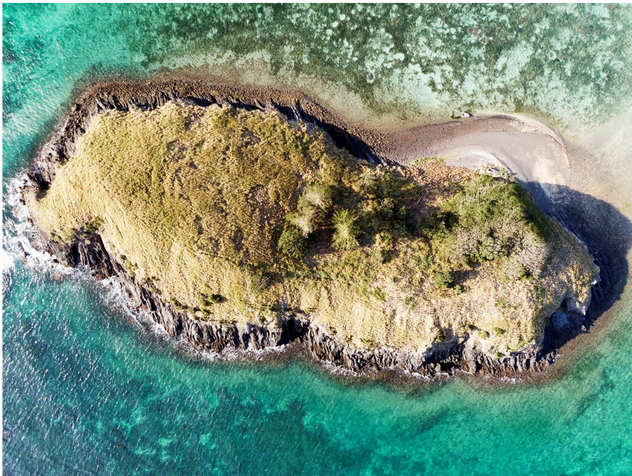
Figure 6. Blackburn Island photographed December 2019 during drought. The island is orientated West-East. Note the fringe of small Melaleuca bushes above the exposed cliffs on the south side and the stunted Lagunaria at top of the slope above the middle gully. Previously surveyed areas include the central clump of Araucaria trees and the large sprawling Ficus at the eastern end.

westerlies. These trees, about 12 individuals altogether, include a large Ficus macrophylla ssp. columnaris , Howea forsteriana sheltered by the Ficus , several Lagunaria patersonia and three exotic Araucaria heterophylla (Fig. 6). Blackburn Island has been formally surveyed for vertebrates (Carlile & Priddell, 2013) and the endemic cockroach Panesthia lata (Carlile et al. , 2018), but these authors made no mention of any other significant invertebrate species. As far as we are aware, the first entomological survey of Blackburn Island was by Tim Kingston in 1979 and 1980 (unpublished, material in Australian Museum), and the island was also sampled as part of an extensive study of different habitats on Lord Howe by the Australian Museum in 2000–2001 (Cassis et al. , 2003). Recently the beetles of Blackburn Island have been surveyed annually (Reid et al. , 2018a; Reid & Hutton, 2019; this report) (Table 2). Blackburn Island has at least three large beetles no longer found on the main island of Lord Howe, Cormodes darwini , Cryptodus tasmanianus and Promethis sterrha (Reid & Hutton, 2019) (Table 3).