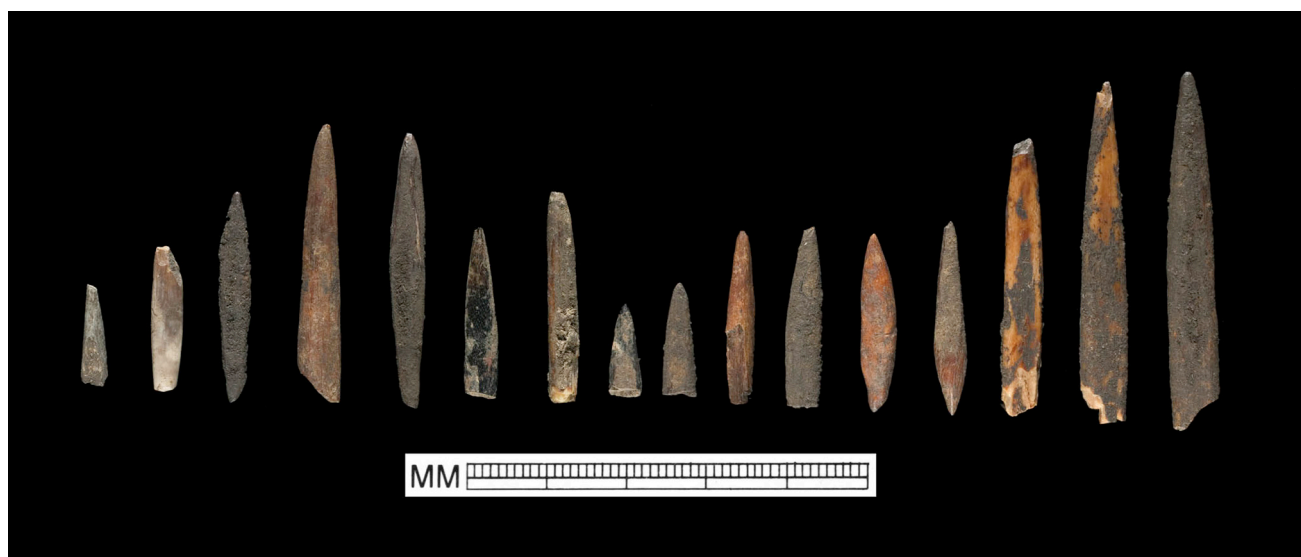
Figure 2. Adelaide River bone points (Adelaide River collection, MAGNT).

Physical state of the remains. The fragmented nature of the fauna means that much of it remains unidentified. As the analysis examines the distribution of fauna by weight through the deposits, it must be borne in mind that the results can be regarded only as gross indicators of foraging strategies. The fragmented state of the faunal remains and the amount that could not be identified, as well as the taphonomic factors (extremes of wet and dry seasons, exposure on open sites, trampling by feral buffalo) in operation at the sites, mean that delicate species are probably under-represented or entirely undetected.