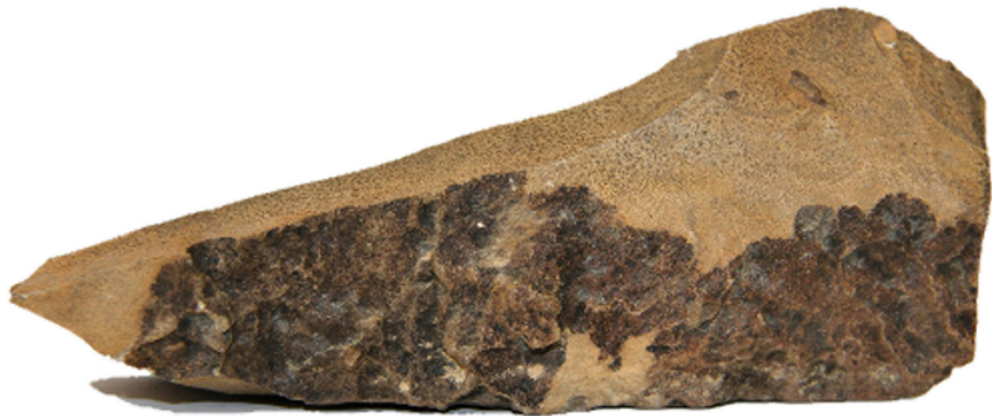
Figure 17. Hoe, AM E9660, 13 cm long, 250 g. Scale 5 cm.