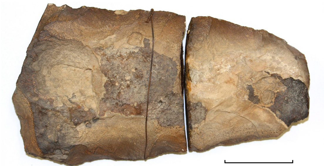
Figure 2. Preform of a cleaver, AM E9582, 20 cm long, 658 g. Scale 5 cm.