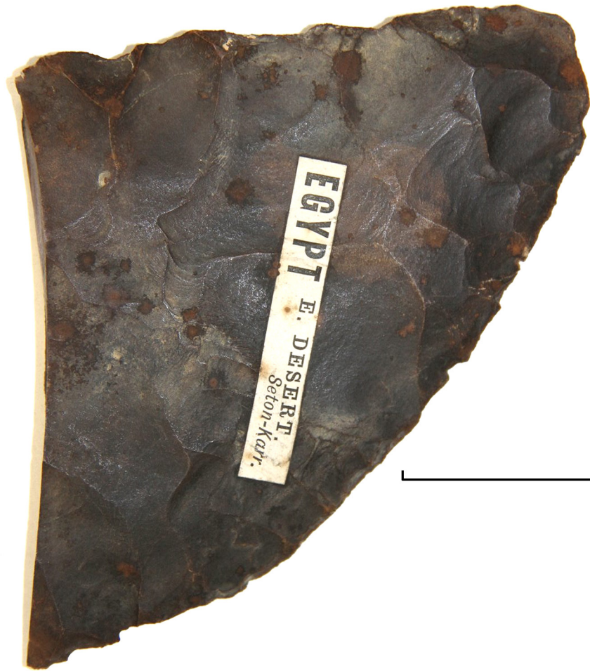
Figure 11. Fragment of crescent knife, AM E9666, 15.5 cm long, 190 g. Scale 5 cm.