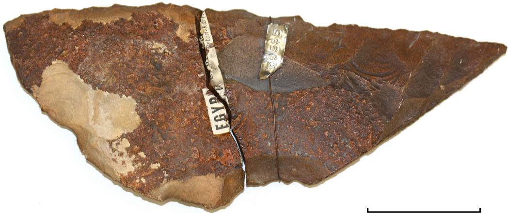
Figure 6. Preform of a knife, AM E9595, 24 cm long, 450 g. Scale 5 cm.