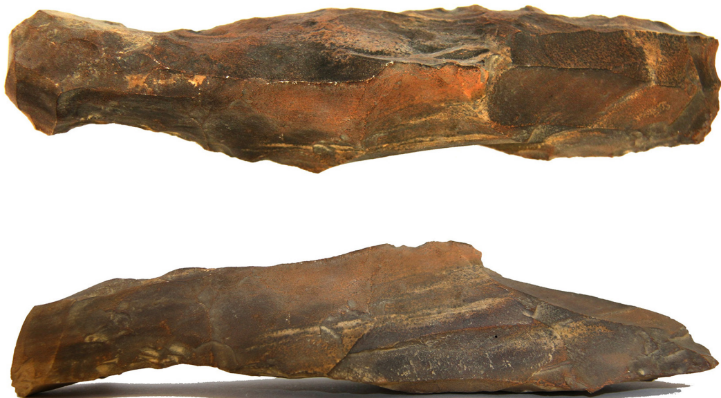
Figure 15. Pick, AM E9653, 21 cm long, 482 g. Scale 5 cm.