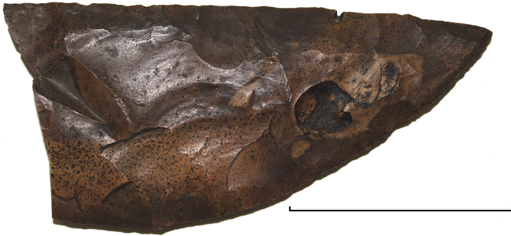
Figure 8. Knife-fragment, AM E9639, 9.5 cm long, 44 g. Scale 5 cm.