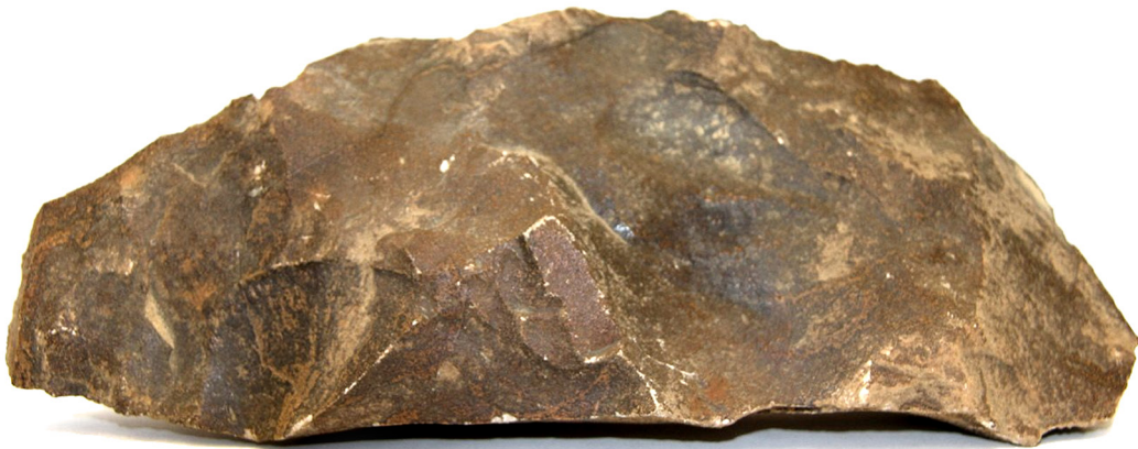
Figure 14. Preform of a pick with crest, AM E9661, 21 cm long, 848 g. Scale 5 cm.