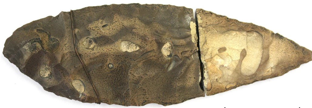
Figure 3. Knife, AM E9617, 19 cm long, 170 g. Scale 5 cm.