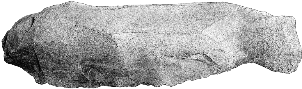
Figure 16. Pick, MV X6810, 19 cm long, 594 g. Scale 5 cm.