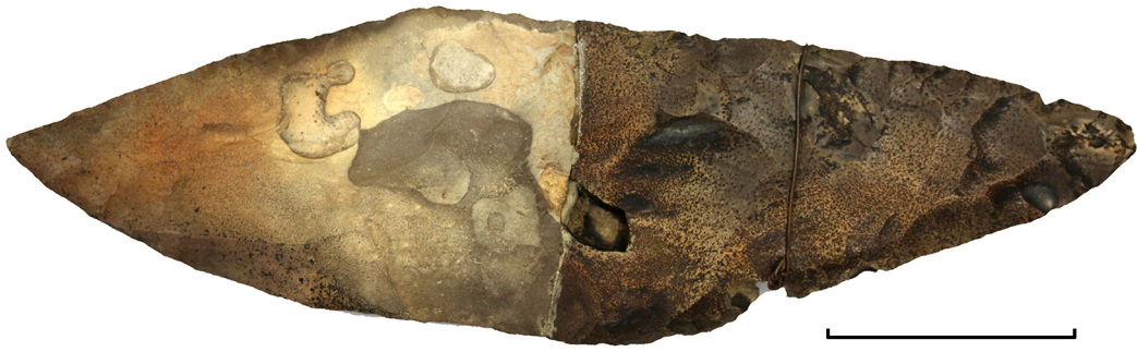
Figure 5. Knife, AM E9681, 23 cm long, 222 g. Scale 5 cm.