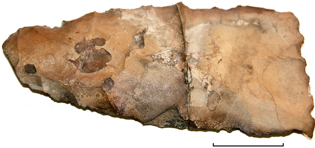
Figure 13. Advanced preform of a cleaver, AM E9602, 23.5 cm long, 722 g. Scale 5 cm.