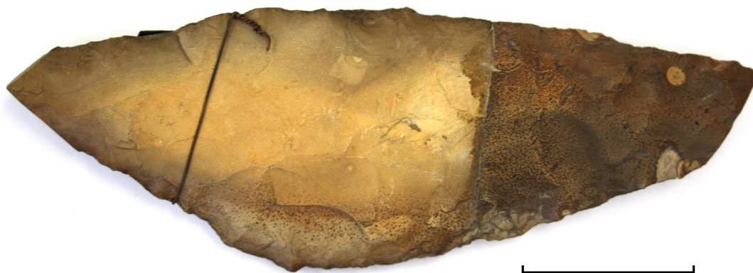
Figure 4. Preform of a knife, AM E9616, 21.5 cm long, 332 g. Scale 5 cm.