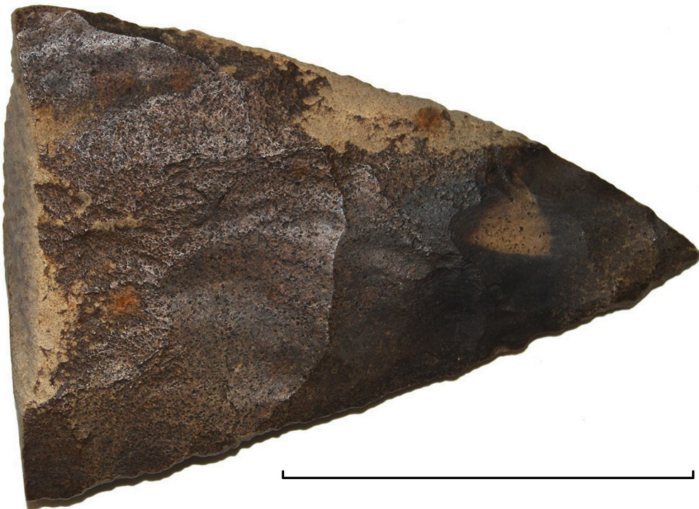
Figure 7. Knife-fragment, AM E9637, 8.5 cm long, 34 g. Scale 5 cm.