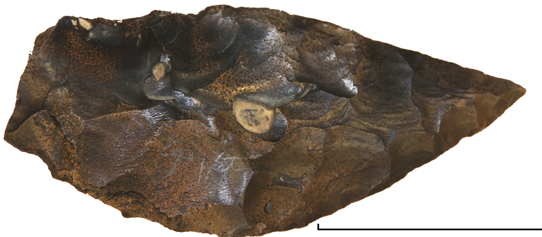
Figure 10. Fragment of a short knife, AM E9627, 12.5 cm long, 82 g. Scale 5 cm.