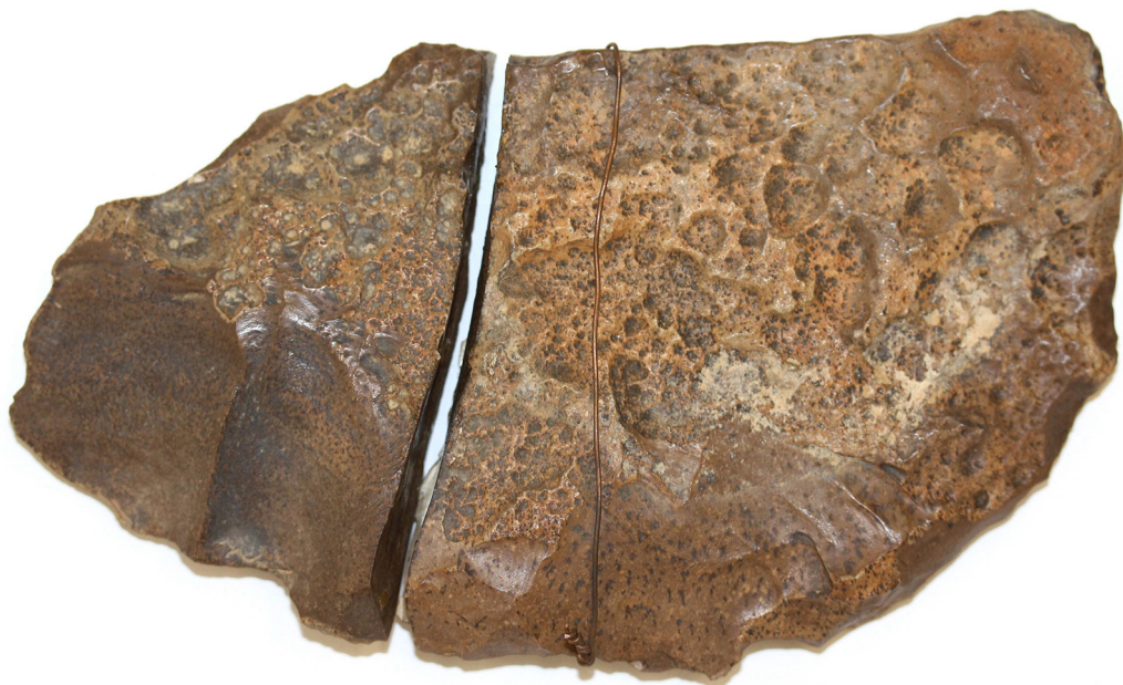
Figure 9. Preform of crescent knife, AM E9581, 17 cm long, 330 g. Scale 5 cm.