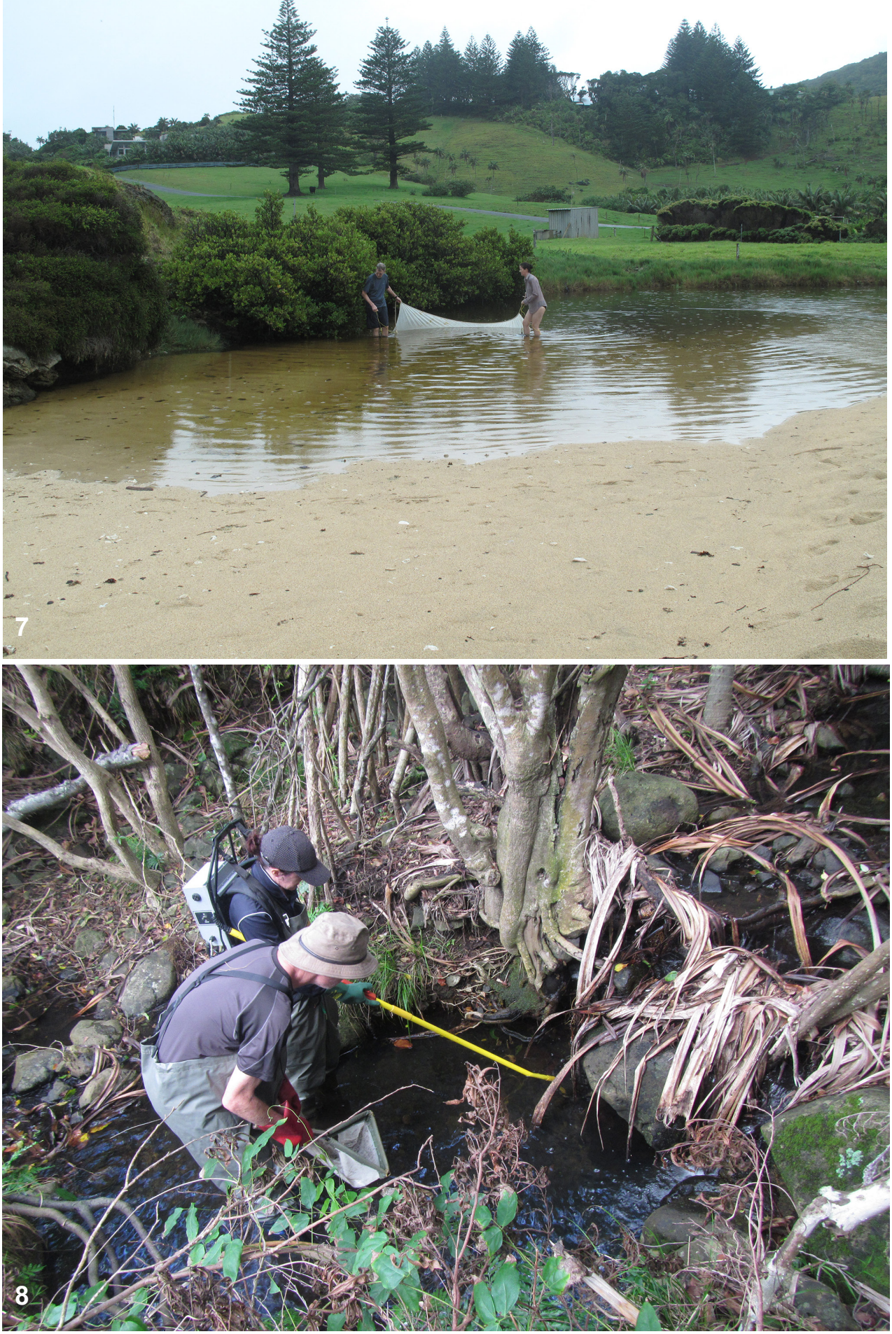
Figures 7, 8. Lord Howe Island collecting sites. (7) Lagoon seaward of Soldiers Creek (Site 11), two person fine-mesh seine. (8) Boat Harbour, North (Site 17), backpack electrofishing.