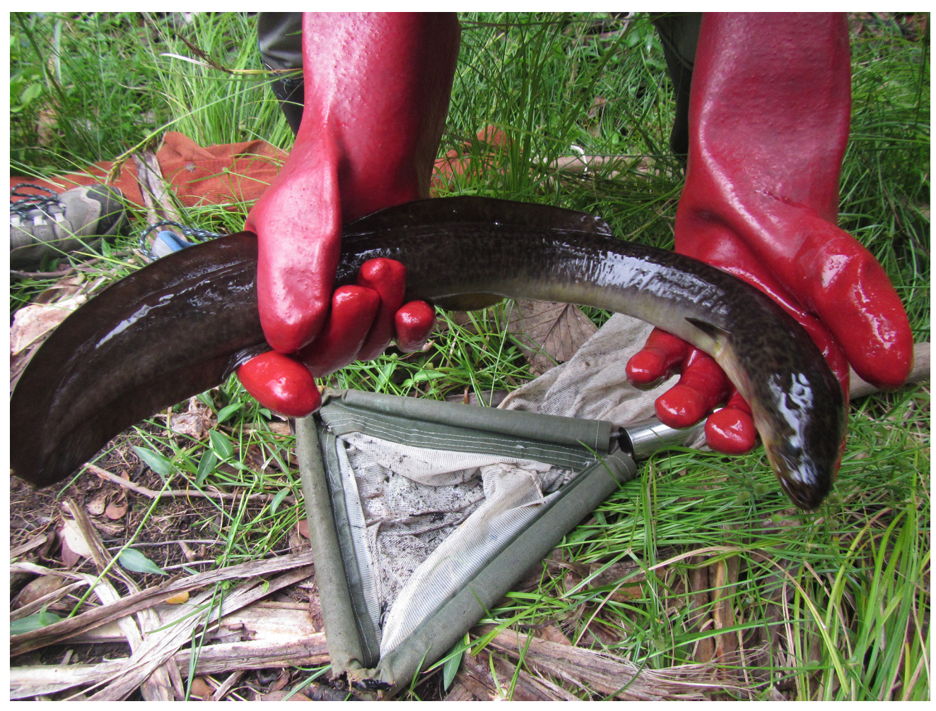
Figure 3. Anguilla reinhardtii collected and released at site 17, Boat Harbour (north).

McDowall, 1996; Merrick & Schmida, 1984) (Figs. 2, 3). The Australian Museum has seven collection event records from Lord Howe Island for this species, with collections made between 1889 and 1973. In March 2017 A. reinhardtii was recorded at sites 10, 12, 13, 17 and 20 (Table 1, Figs 2, 3, 10).