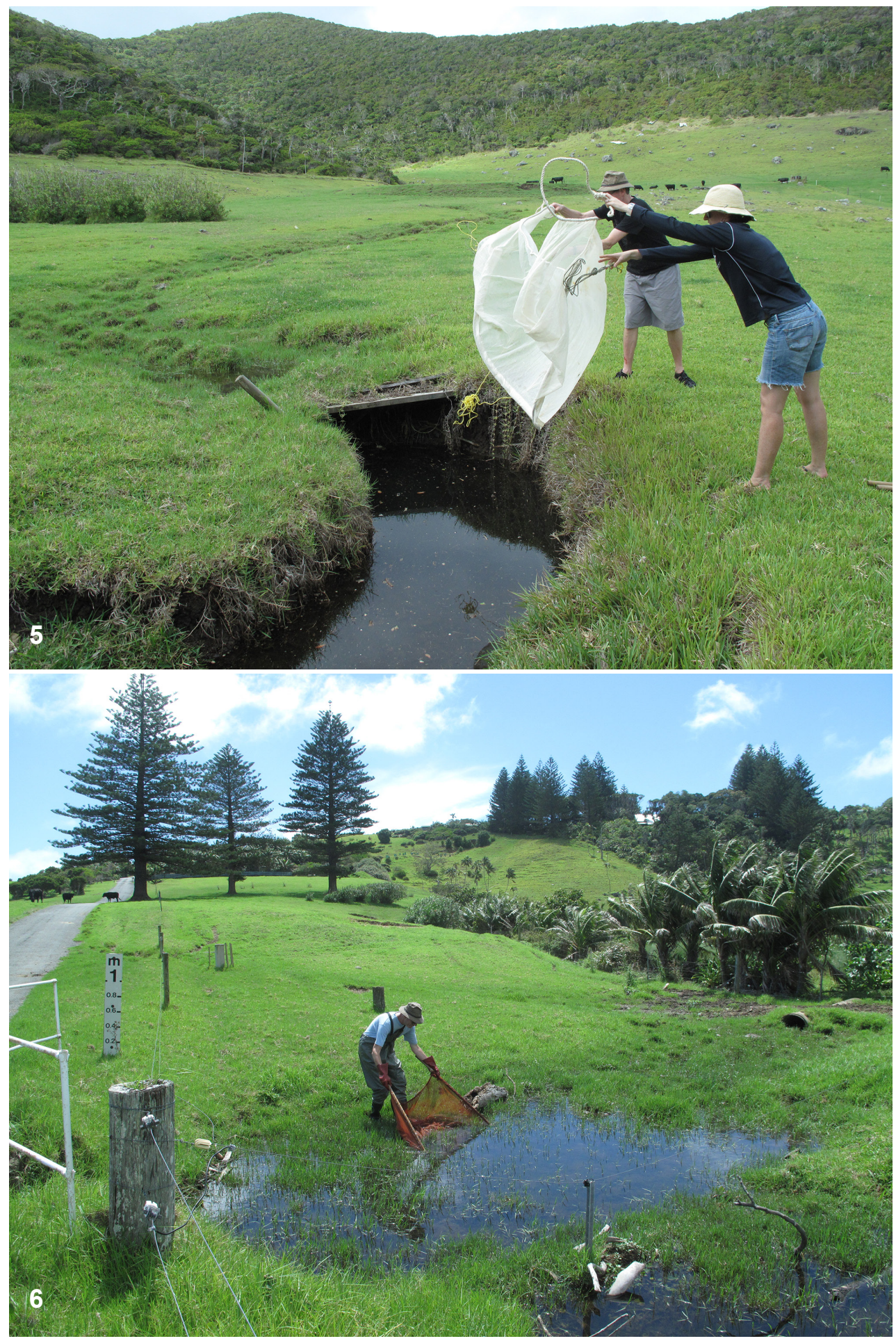
Figures 5, 6. Lord Howe Island collecting sites. (5) Old Settlement Creek (Site 4), sampling with a two-person fine-mesh seine; (6) Creek to east of Lagoon Road (Site 10), single-person seine.