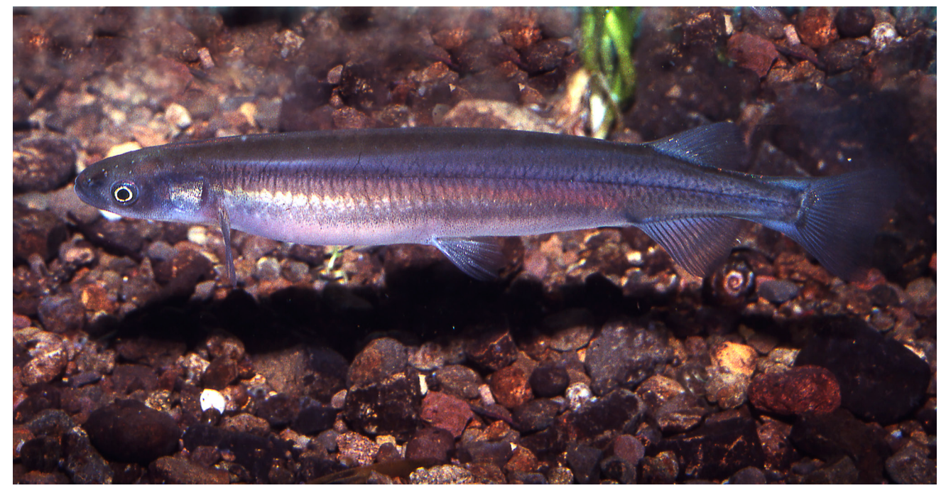
Figure 4. Galaxias maculatus collected by Ian Hutton lagoon seaward of Soldiers Creek, site 11 in 1989. The fish was photographed in an aquarium.

filling with water. Storm conditions also meant that access to two sites, Erskine Valley and an unnamed creek on the eastern side of Mt Lidgbird was not possible due to dangerous conditions.