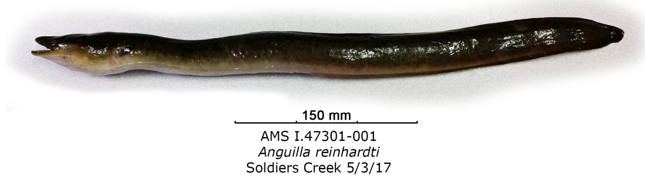
Figure 2. Anguilla reinhardtii collected at site 12, Soldiers Creek.

Distinctive dark blotching on an olive or brownish background. Paler ventrally with dark brown median fins. Inhabits freshwater streams, lakes and swamps with a preference for flowing water. Commonly occurs in eastern Australian coastal drainages. Also found in Papua New Guinea and New Caledonia. Spawning migrations are similar to those described above for A. australis (Allen et al. , 2002;