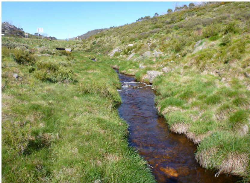
Figure 17. Collecting site and possible habitat of Minipteryx robusta at 1638 m a.s.l., Pipers Creek, Kosciuszko National Park.

Manuscript submitted 28 July 2015, revised 22 October 2015, and accepted 22 October 2015.