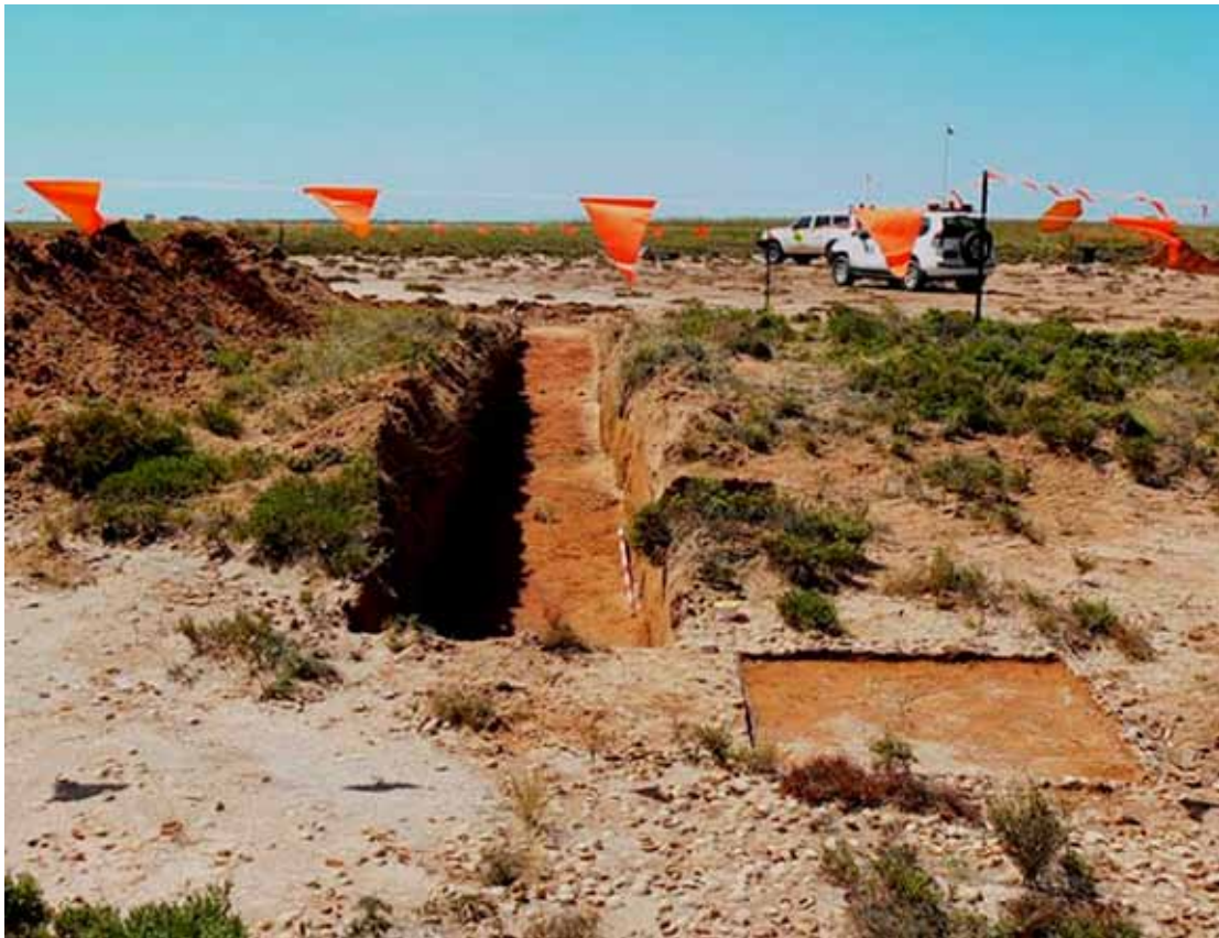
Figure 13. WN07-06. The rise is a sandy chenier ridge resting on RRB exposed in the base of the trench. The shell and white sand in the foreground is inundated during every spring tide cycle.