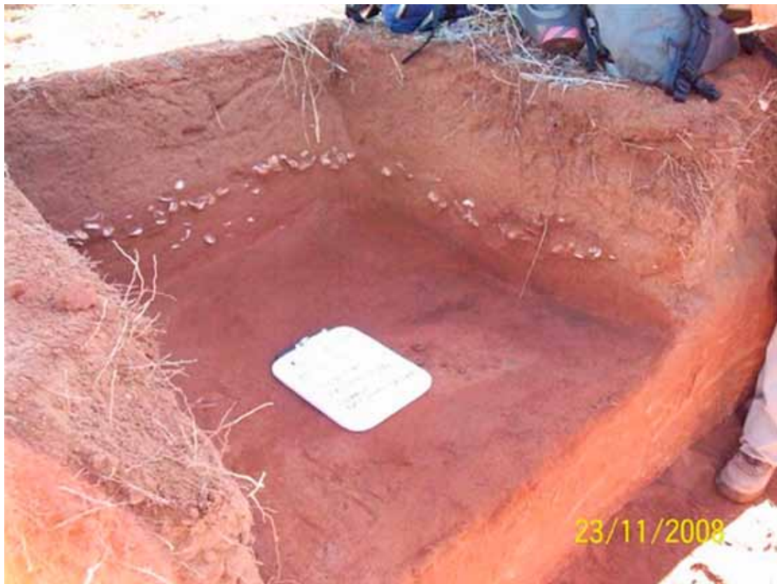
Figure 7. BD08-05. The layer of wave-dispersed shell about 300 mm below the surface is just above the surface of the RRB.