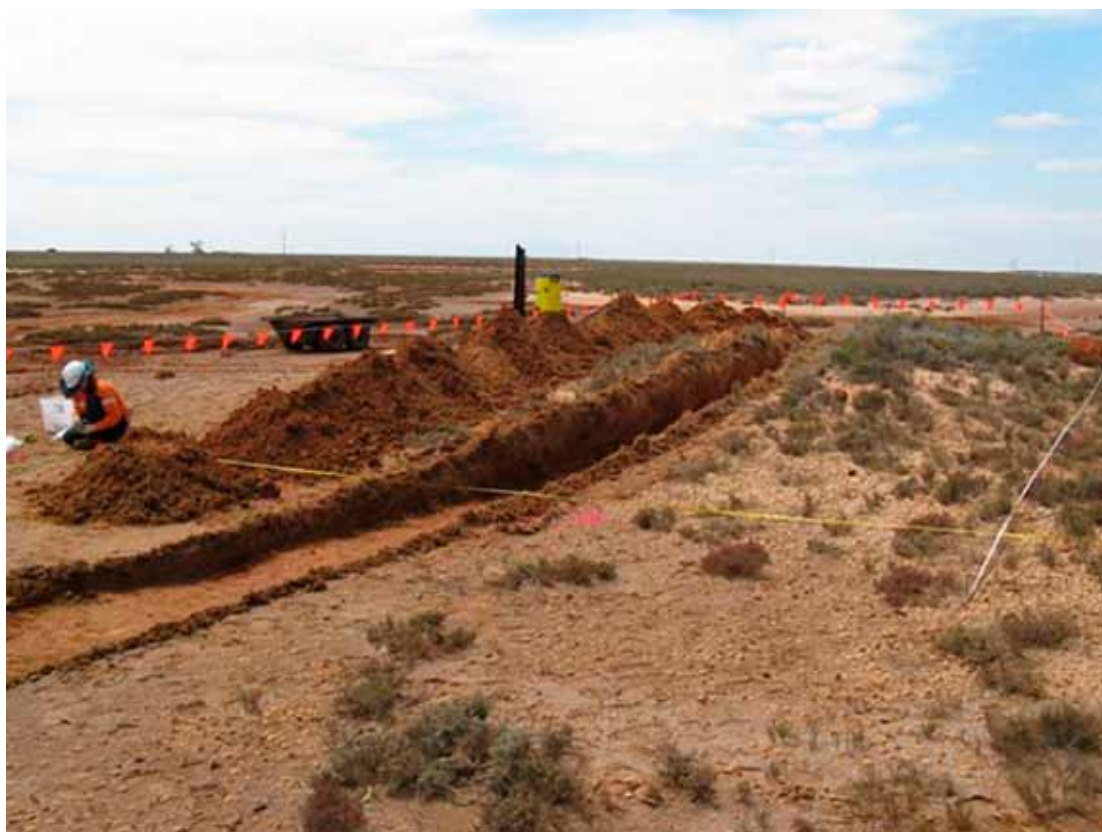
Figure 10. BD08-15. The trench cuts through a sandy chenier ridge with concentrations of shell on its lower flank.