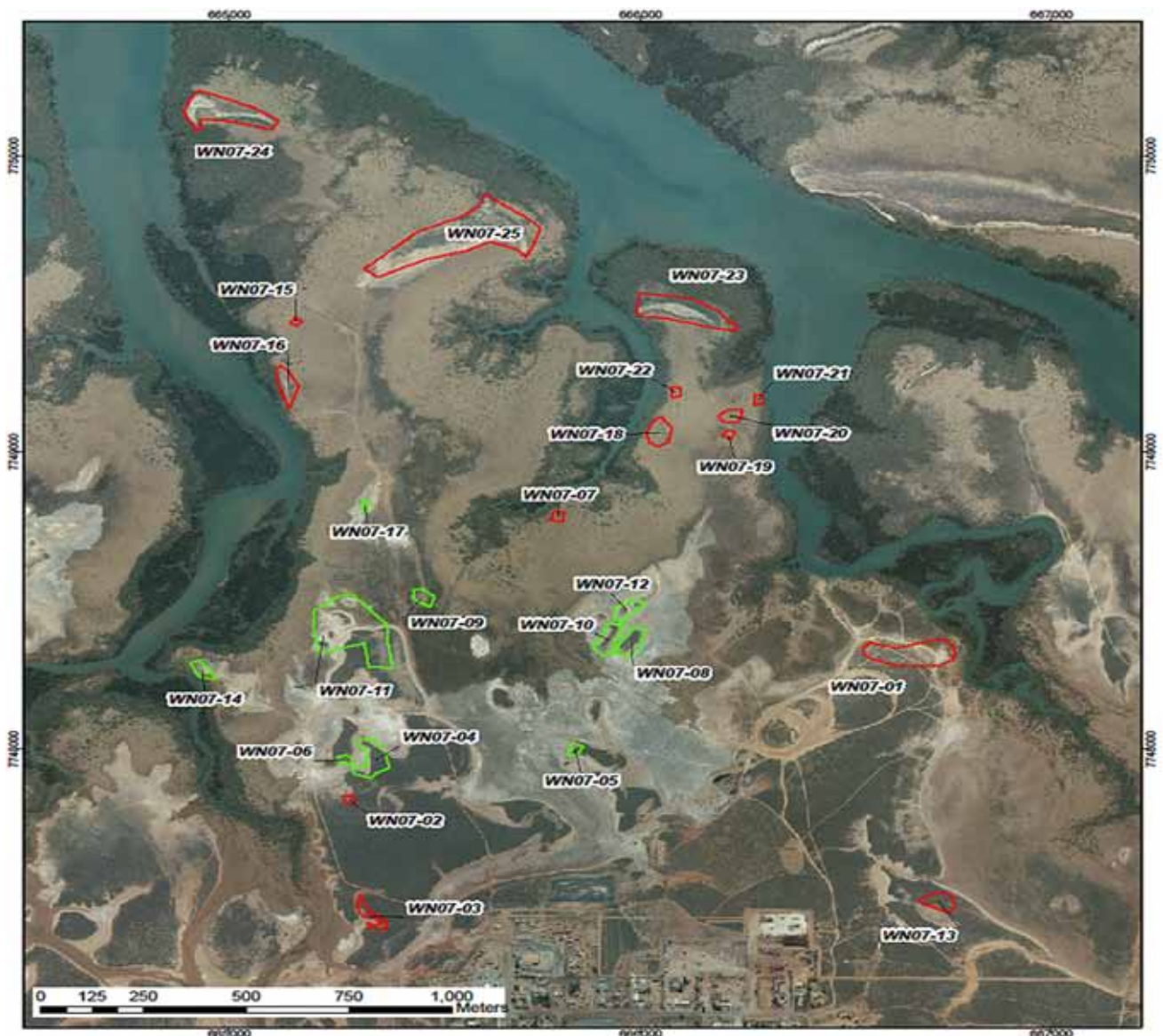
Figure 4. The Wedgefield North study area showing the excavated sites in green and other recorded sites in red. The Harrison (2009) study area is left (west) of the major mangrove-lined tidal creek on the left side of the image.

truncated, and a “planated” or uniform surface with similar elevations occurs across the whole of Wedgefield North.