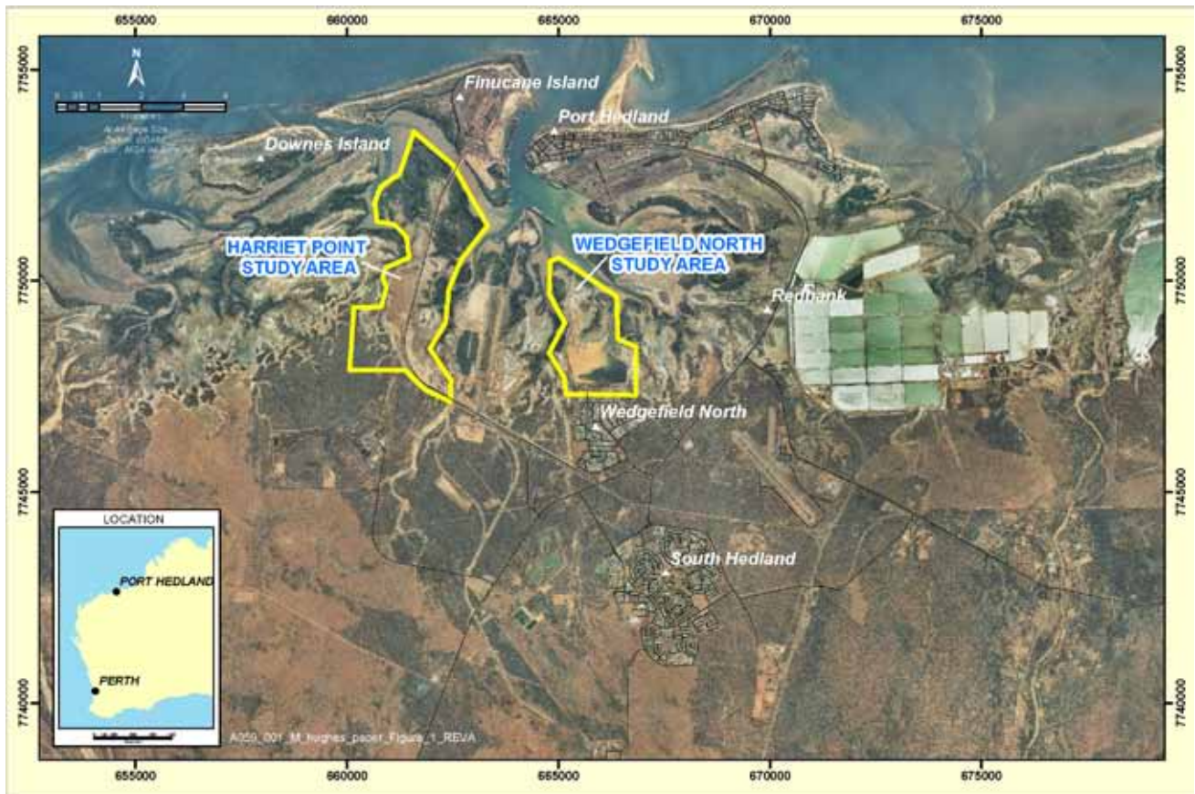
Figure 1. Location of the study area. Map prepared by BHP Billiton Iron Ore P/L.

landscape settings, and the excavation methods were focused on recovering information on both the shell accumulations and the sedimentary deposits within which they occurred.