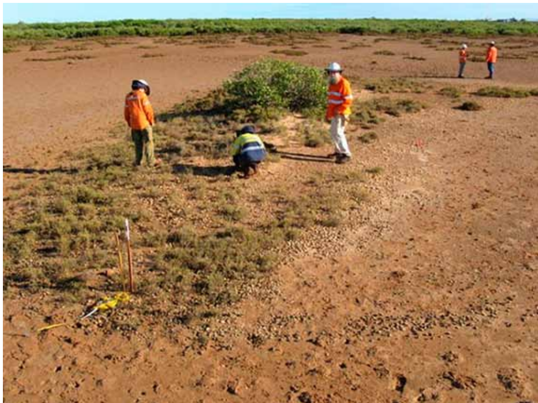
Figure 8. BD08-03. View looking east along this shelly chenier ridge. Note the mangrove shrub growing on the crest of the ridge.