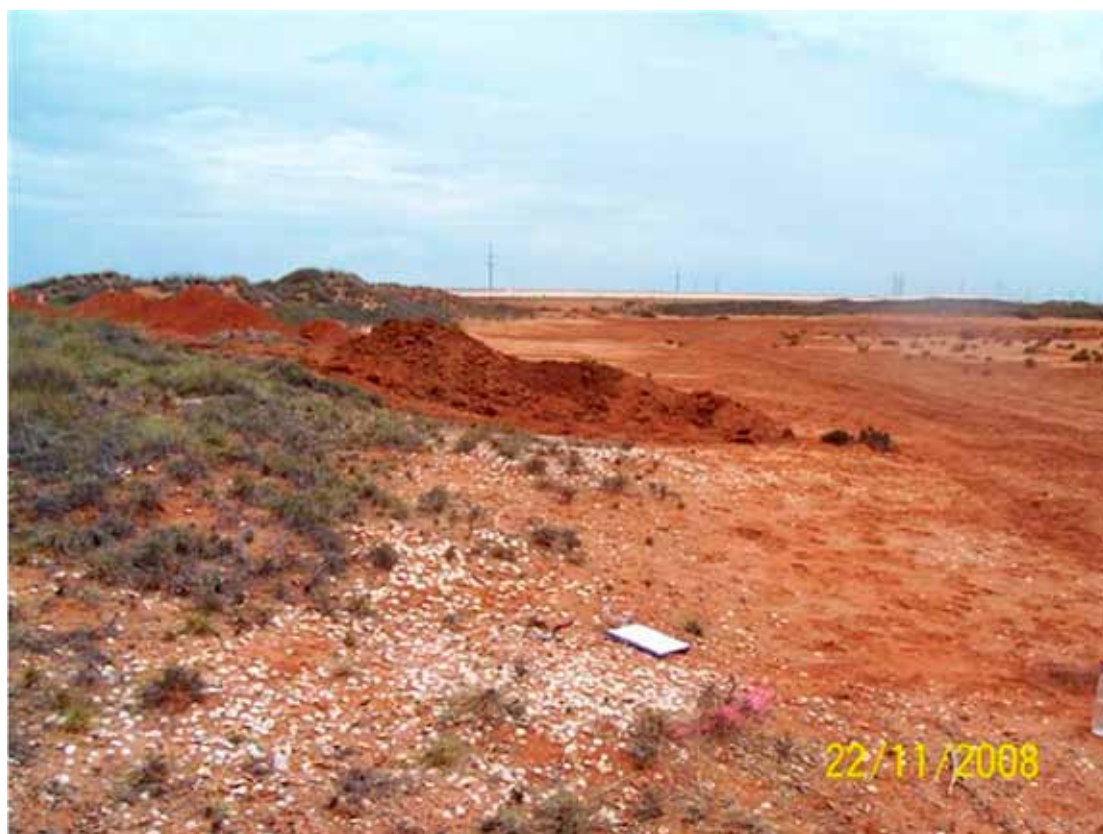
Figure 5. BD08-05. Shell on eroded western flank of sand sheet adjacent to a tidal channel. Trench dug through Pindan Sand to Pleistocene clayey sand, the Reworked Red Beds (RRB).