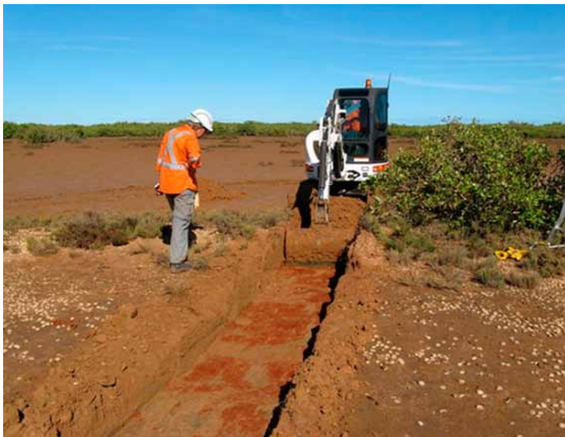
Figure 9. BD08-03. Trench through the chenier ridge looking north. Between the red mottled RRB and the paler shell-rich upper sand is a layer of c. 300 mm of Holocene estuarine muddy sand, which appears as a darker, greyish brown colour.