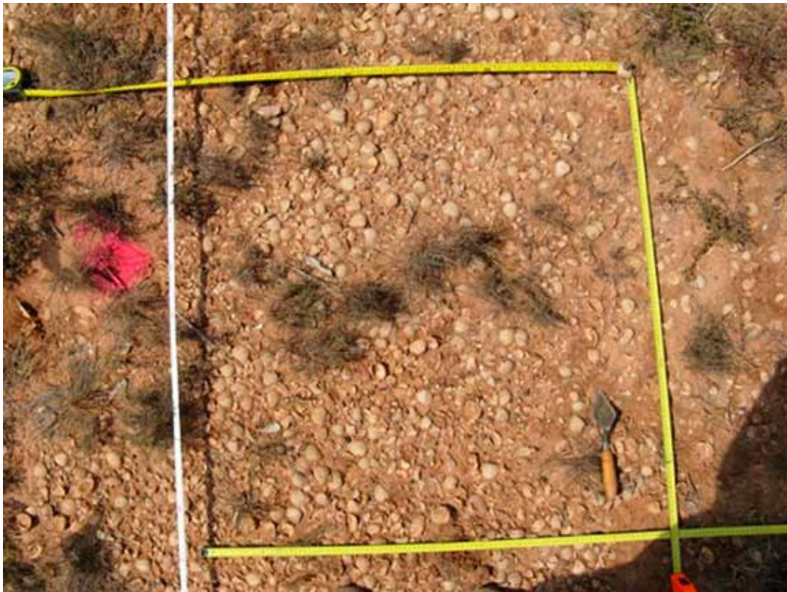
Figure 11. BD08-15. Square on lower flank of chenier ridge before shell collected.