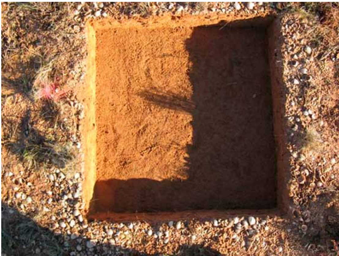
Figure 12. D08-15. Square in Figure 10 after shell collected. Shell occurred only on the surface and to a depth of about 50 mm.