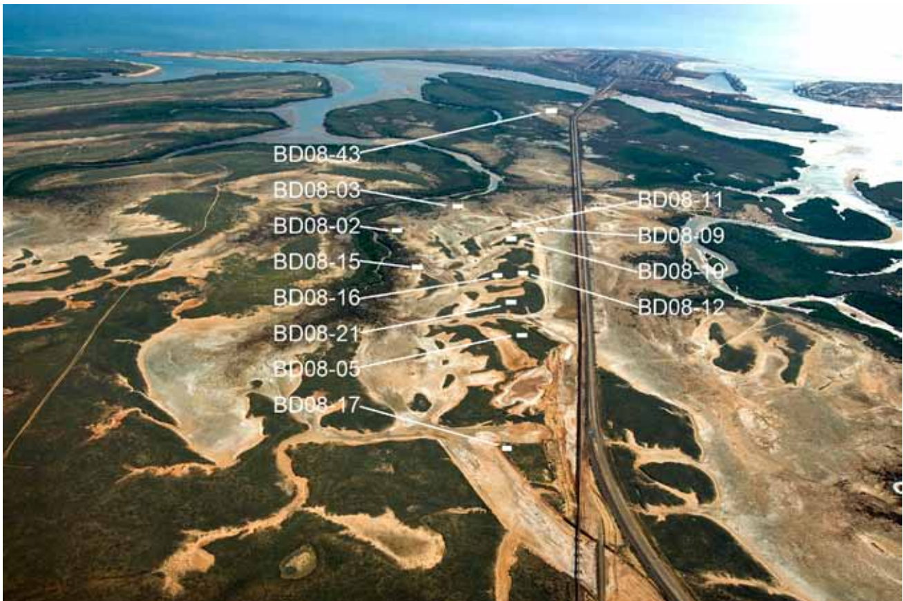
Figure 3. Oblique airphoto looking north across the Harriet Point study area at low tide showing the sites on the remnants of the sand sheet in the middle, the bare tidal flats and channels surrounding them and the mangrove lined creeks and shoreline in the distance. The Harrison (2009) study area is just beyond the right side of the image.

it is inundated with saltwater. This sand sheet is dissected by a network of shallow (up to 1.5 m), wide (10–200 m) tidal channels (Qci on the geological sheet—see Table 1), and its margins, especially those facing north and west, are eroding due to wave and tidal action (Fig. 5).