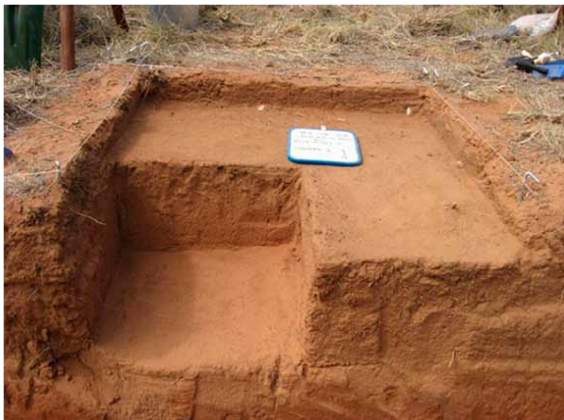
Figure 6. BD08-05. The base of the excavation through the Pindan Sand is down to the surface of the RRB. No shell was found below about 100 mm.