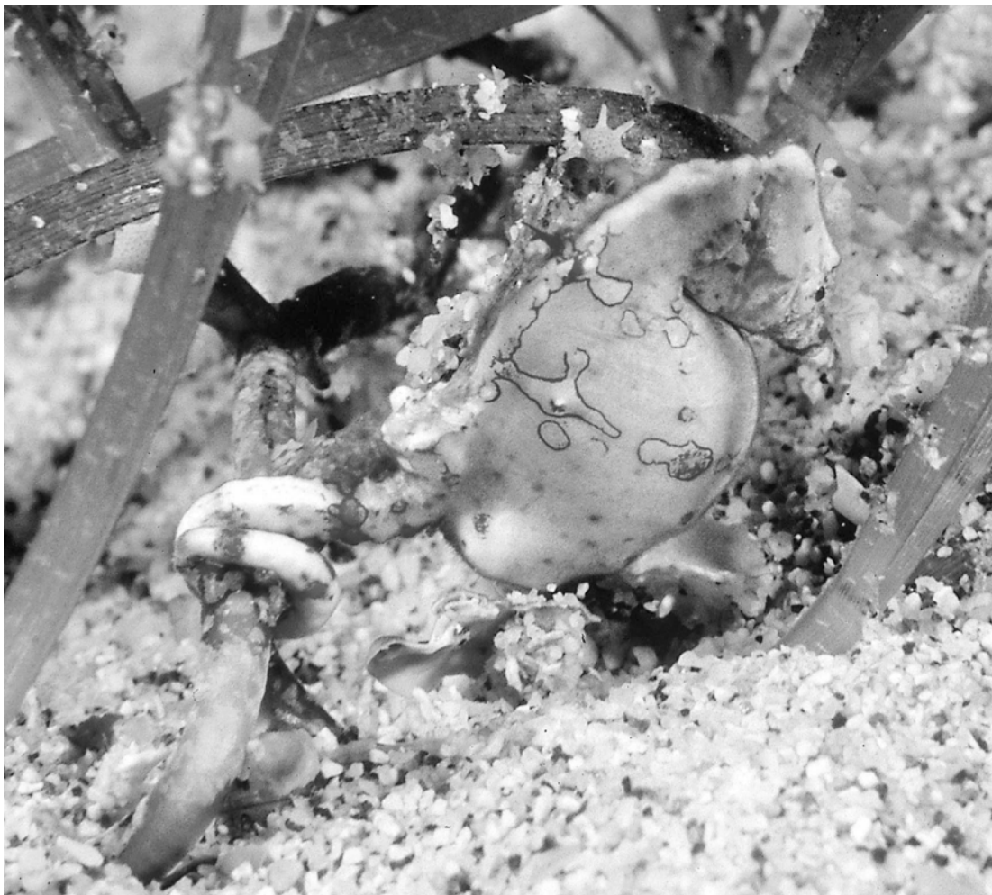
Fig. 4. Hippocampus colemani , this specimen not collected. A probable male as it appears to have a pouch.

Australian Museum in 1973. At the time, a team of 15 collectors, 8 of whom were ichthyologists, collected constantly for one month (Allen et al. , 1976), and did not find this seahorse.