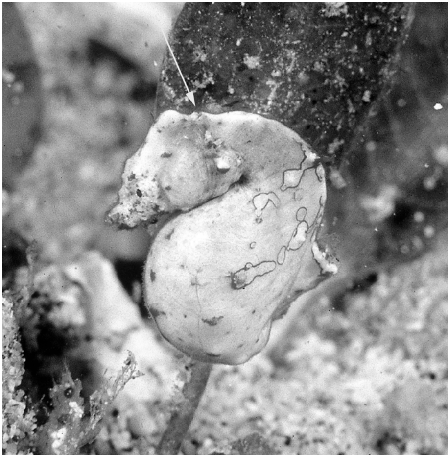
Fig. 3. Hippocampus colemani , this specimen not collected, sex not determined. The single gill opening is arrowed.