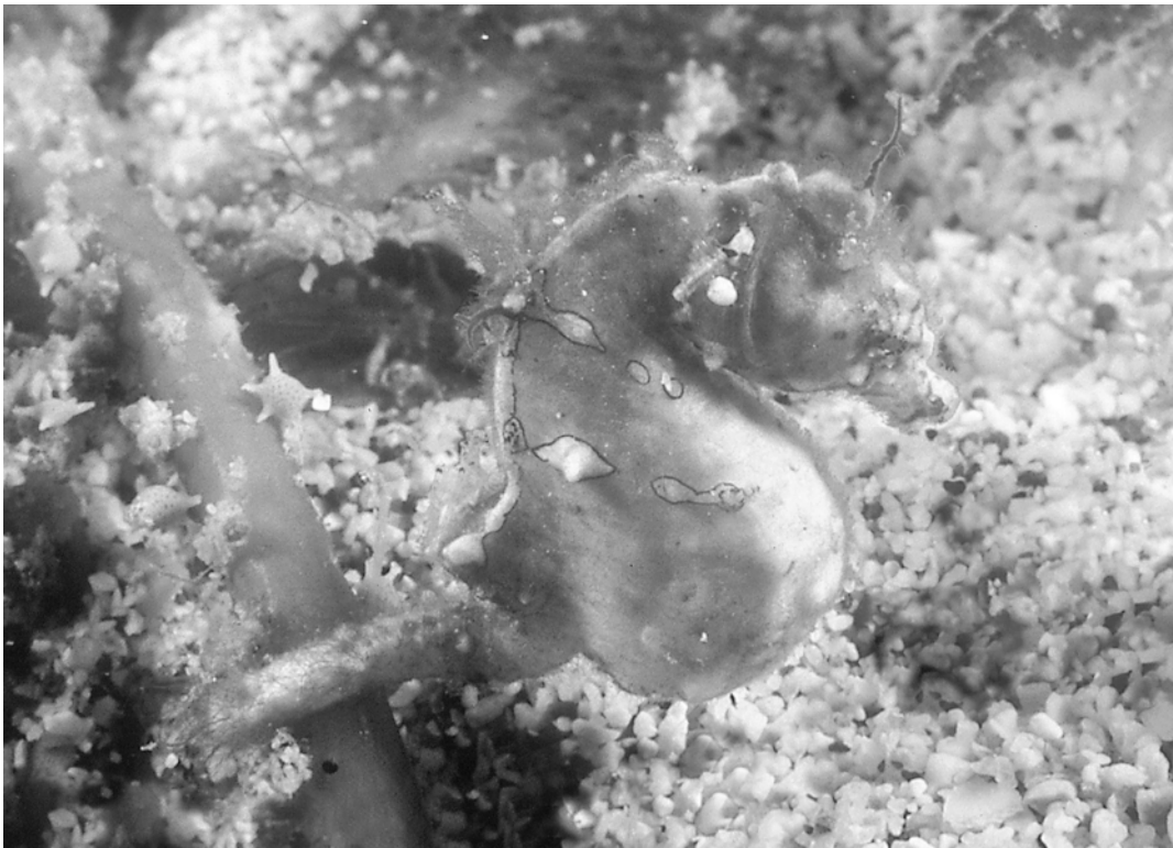
Fig. 2. Hippocampus colemani, paratype AMS I41181-002, in situ.