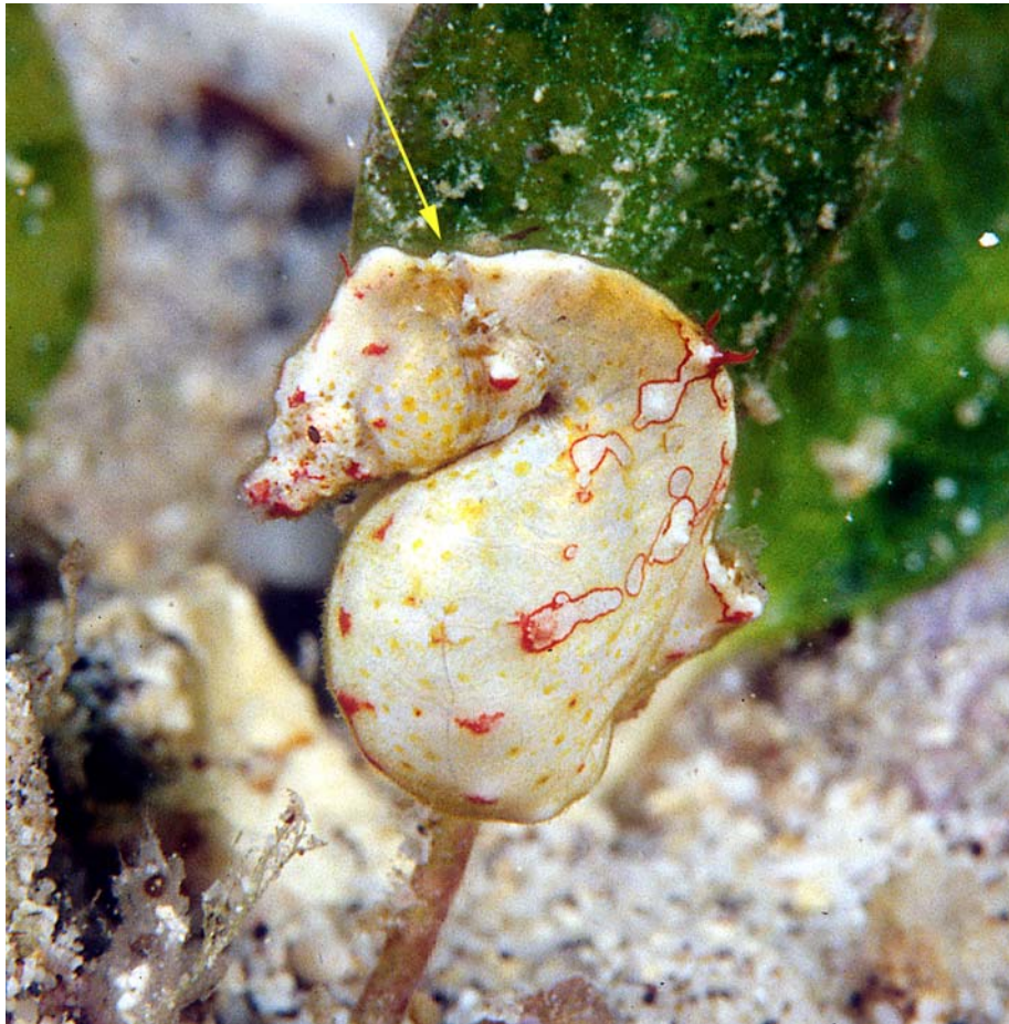
Fig. 3. Hippocampus colemani , this specimen not collected, sex not determined. The single gill opening is arrowed.