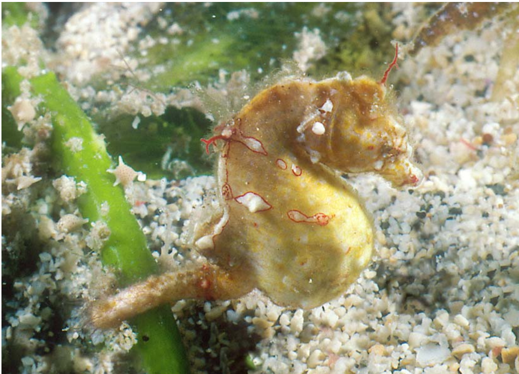
Fig. 2. Hippocampus colemani, paratype AMS I41181-002, in situ.