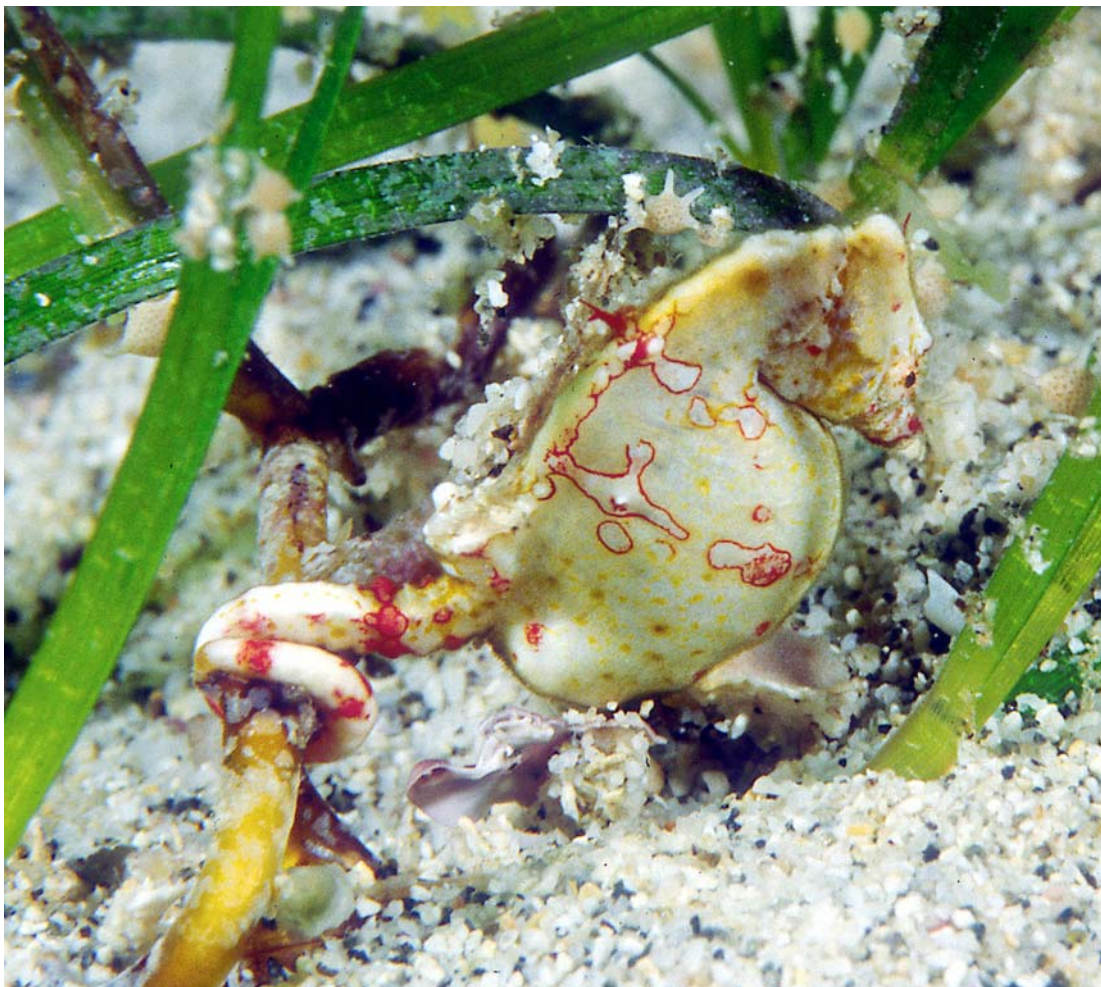
Fig. 4. Hippocampus colemani , this specimen not collected. A probable male as it appears to have a pouch.

Australian Museum in 1973. At the time, a team of 15 collectors, 8 of whom were ichthyologists, collected constantly for one month (Allen et al. , 1976), and did not find this seahorse.