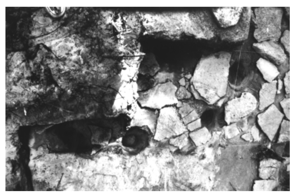
Figure 5. Postholes E, F, G, H, I at northern end of the paved area in Trench EB97:24.

and posthole I respectively, suggesting that the structure dated to about 550 B.P. However, the next set of results (ANU-11051: 570±70 B.P.; Wk-6904: 740±55 B.P.; Wk-6905: 830±75 B.P.), also on broadleaf samples, all came from spit 2 (the same level as the slabs) and covered such a wide span that attempts were made to test whether this was related to the different phases of construction (above) or to variation in the samples. That involved dating some more samples from under the paving and in the covered postholes. Of necessity, these were charcoals from Norfolk pine which,