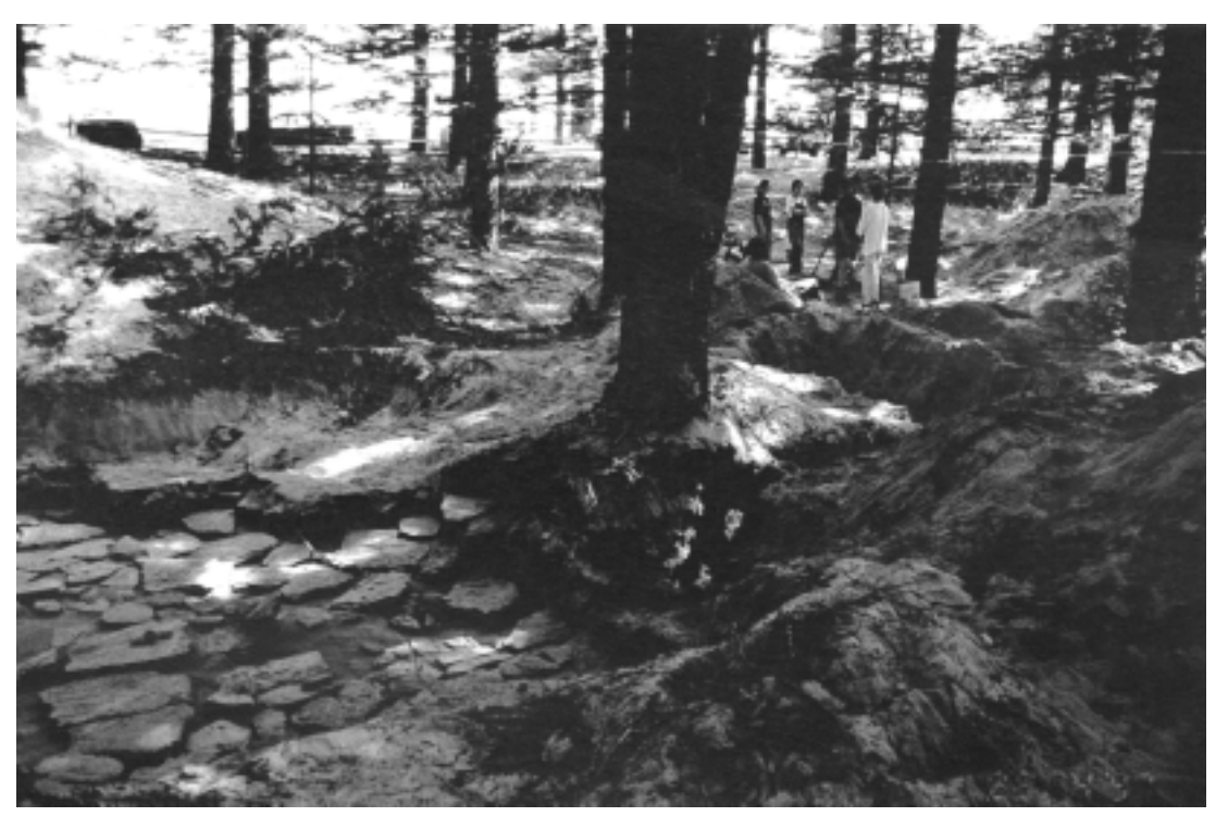
Figure 4. Paved area in Trench EB97:24, looking southwest over EB97:23.

EB97:24 material. Following the obsidian flaking, the site was covered by grey to black sand, generally to a depth of 8–10 cm above the paving. The colour variation seems to be related to the construction of the shallow oven area in Square Z 6, which contained elephant seal bones. Charcoal, evidently from this feature, became distributed in the sand above the paving, staining it black in Squares Z 5, Z 6, A 6 and the southern half of A 5. Elsewhere the sand above the paving is grey to grey-brown. Since the black sand goes