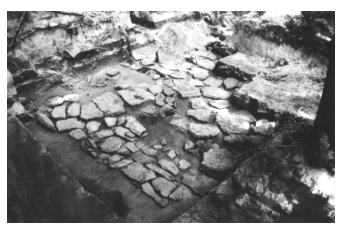
Figure 3. Paved area in Trench EB97:24, taken from northwest.