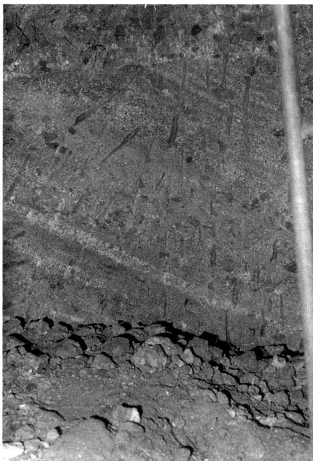
Fig.2. Sapphire bearing pyroclastic deposits at a depth of 20 m on Bedford's Hill, north of Rubyvale, central Queensland.

Irving & Frey (1984) believed that anorthoclase and