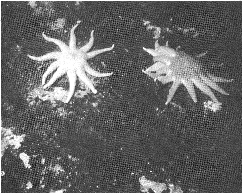
Fig. 3. Solaster dawsoni preying upon a Solaster endeca with a Solaster stimpsoni about 20 cm away. Note the lack of a behavioural escape or defence response by S. endeca . The dark tufts are tentacles of C. lubrica . Cucumaria lubrica covers a major portion of the substratum.

from 1965 to 1974. Its most common predator species, Solaster stimpsoni , did not significantly differ in abundance through a nine year period (Table 4). The top predator, S. dawsoni , averaged 0.7/100 m 2 (2087 m 2 sampled) in 1968-1969 and 0.7/100 m 2 (648 m 2 sampled) in 1972. The interactions controlling the populations of these species differ with trophic level. A large portion of the individuals or available biomass of the C. lubrica population is left by predators (Table 3).