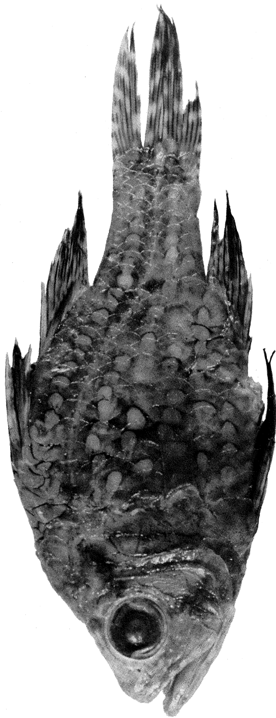
Fig. 1.— Apogon albimaculosus holotype (AM TB. 8347), 66 mm S.L.