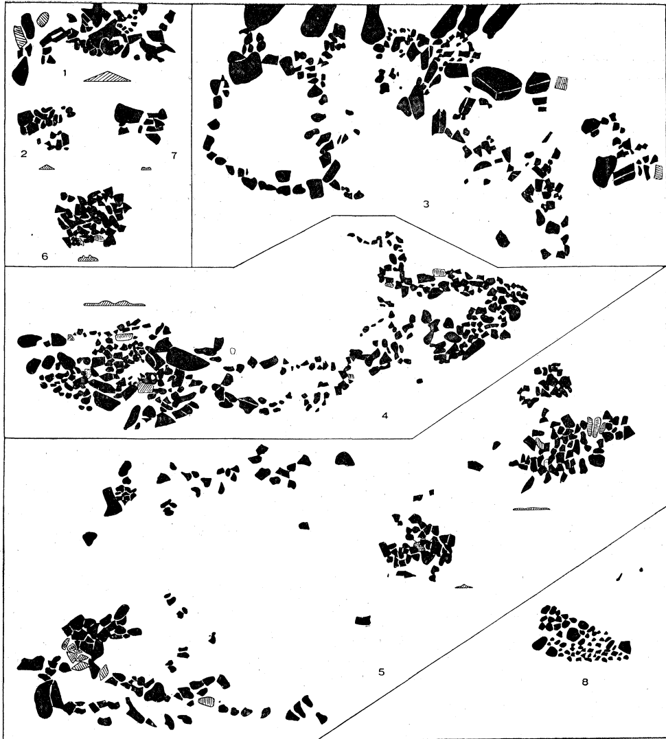
Figs. 1-8 represent the various stone arrangements on Jiningbirna headland.