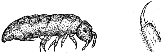
Fig. 51. A. speciosus , Rainb. Fig. 52. A. speciosus (tarsus), Rainb.

Length 0·8 mm. Colour, in some examples bluish-grey above, reddish-grey ventrally; others wholly bluish-grey, but of a somewhat lighter tint underneath. Head .—Large, sub-triangular, truncate anteriorly, clothed with fine short hairs. Antennæ .—